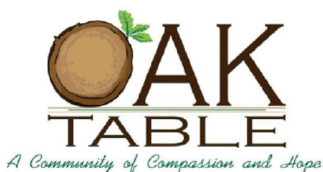
Oak Table Inc.